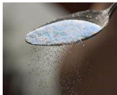
Enough Fun dip® to kill a Carebara atoma ant